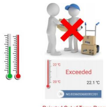
Rejected: Out of Temp Range