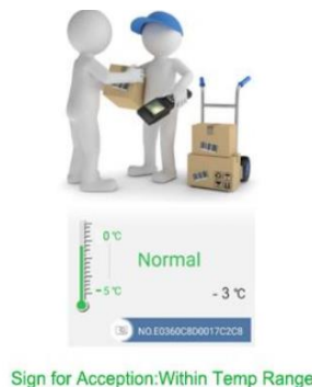
Sign for Acceptance: Within Temp Range