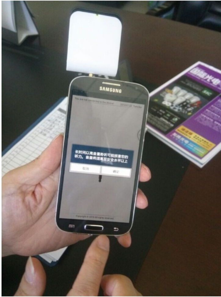
Reader Was Ready For Use Properly